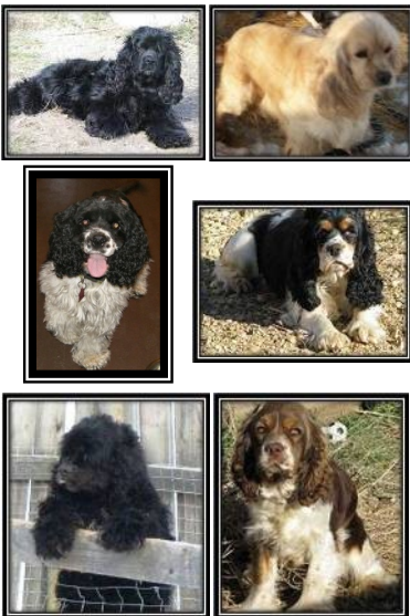
Some of the dogs we have arriving soon!

Whew! Does it ever slow down? Sadly we have come to realize that as long as there are backyard breeders, puppy-mills and people not altering their pets the answer to that is no. We have a number of dogs arriving soon once we have available space. We are currently working on 5 dogs in Saskatchewan (Beauty, Dusty, Twinkle, Sugar and Java) that are being given up by a breeder who is moving and has decided to give up breeding. We have limited information of the dogs at this point but we are anxious to get them here as we understand they are currently