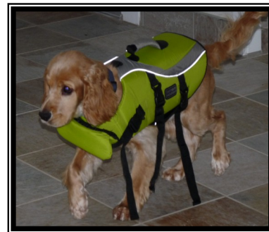
Scooby getting ready to go for his first aqua therapy session @ K9 Fit Fur Fun. For more information about K9 Fit Fur Fun please visit their website www.k9fitfurfun.com